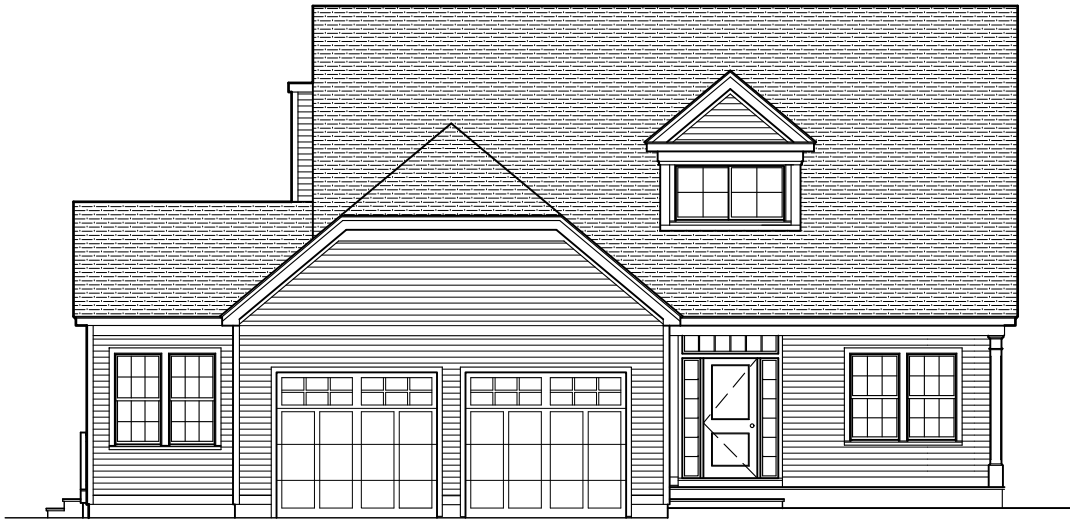
The Preston I Craftsman Edition Front Elevation 1,896 SF 2,020 SF (with Optional Sunroom)

Drawings are Artist's renderings shown with approximate dimensions and may change without notice. Some homes will be built as a mirror image depending on unit location and specific site conditions. See Sales Agent for details.