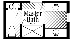
(Optional Master Bath)